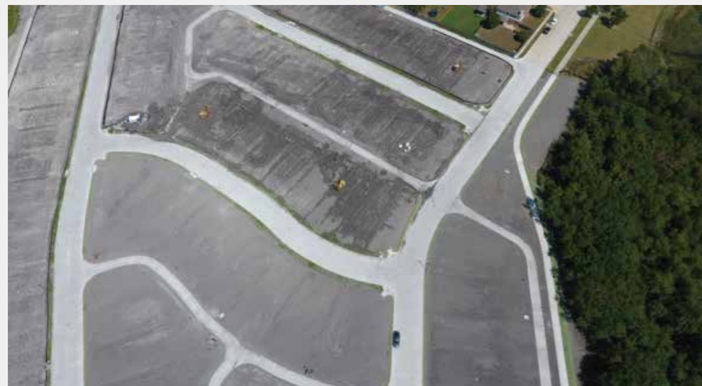
2016年9月无人机航拍图